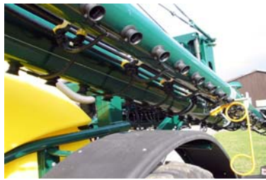
Fig.5: Axial fan with 800 mm rotor

cleaning the inside of the tank and rinsing the fluid-conducting sprayer parts when the sprayer is not in constant use. In addition, the rinsing water tank (Volume: 258 l) has an integrated heat