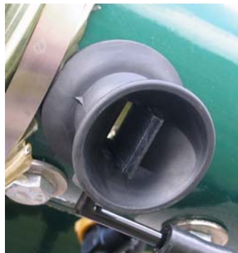
Fig.6: Result table

The liquid flows to the nozzles at low pressure (0.5 to 1.3 bar), is carried by the air and driven to the distribution lip. At the same time, the air which escapes supports the transport of the drops to the target area. The height of the boom can be adjusted hydraulically and infinitely using a lifting frame between 400 and 2050 mm.