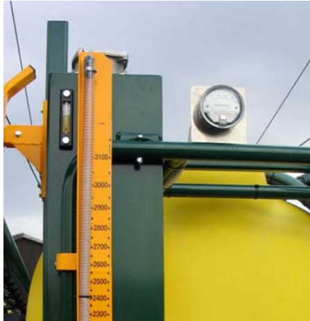
Fig.4: Front side with draw bar, pump, suction filter and front tank contents indicator

cleaning the inside of the tank. The pressurised agitator, which can be switched off, consists of a stainless steel pipe which lies directly above the ground, with a total of 12 injector nozzles. Separate rinsing water tank made of polyethylene for diluting the technical residues,