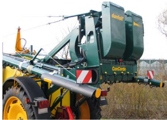
Fig.7: Manually operated control valves

The pendulum suspension has a central pendulum with a pendulum range up to 3° and hydraulic slope compensation up to 5 %. The boom is divided mechanically into 7 segments of which the