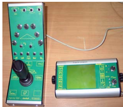
Fig.8: Result table

Design: decentralised control valves with pressure regulation valve at the front of the sprayer and spray section valves on the boom support. AgroMaster and AgroJoy within sight and reach of the operator. Shut-off valves: